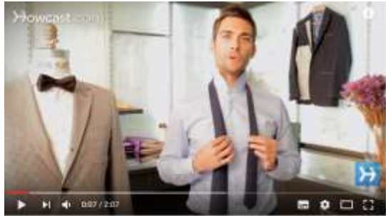
How to Tie a Windsor Knot | Men's Fashion

https://www.youtube.com/watch?v=T0NPYZyI7V8