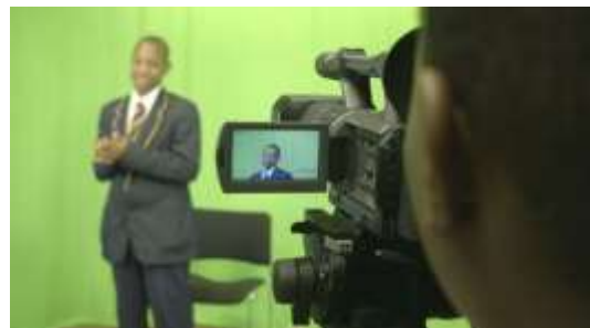
Using the camera's microphone